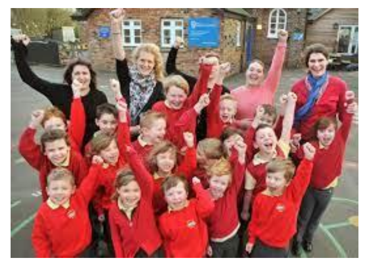
Gazette and Herald

Please get in touch on <a href="mailto:fostonoffice@foston.n-yorks.sch.uk">fostonoffice@foston.n-yorks.sch.uk</a> if you would like to visit our school to see what we have to offer in our flourishing Early Years Setting.