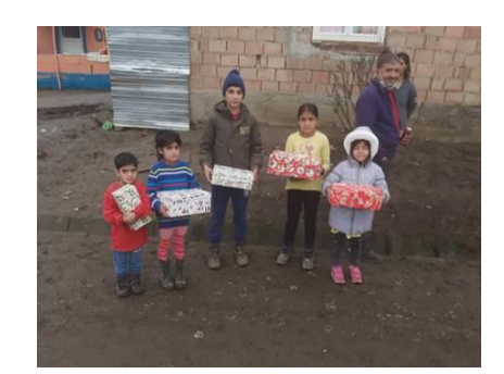
Romanian children with their gifts