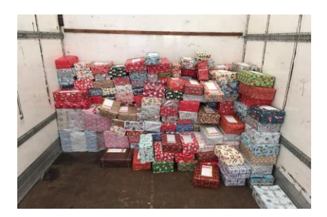
Loaded and ready to go!