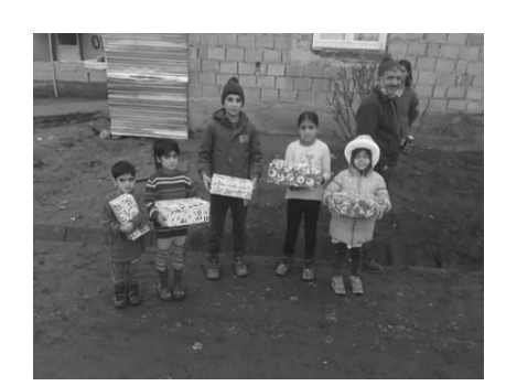
Romanian children with their gifts