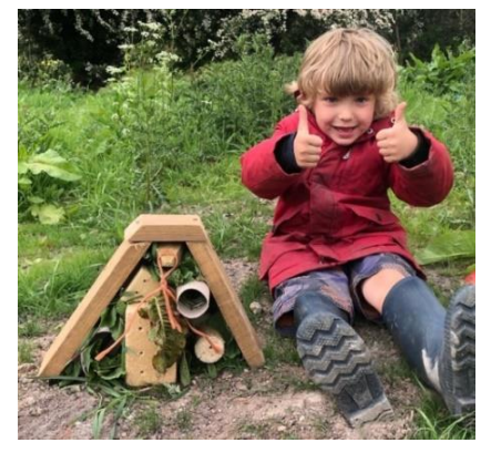
Sonny's Bug Hotel