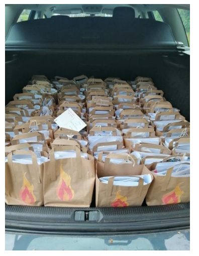
126 bags loaded and ready to go!

Many thanks to all the helpers who volunteered to take the bags around the villages.