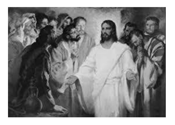
Jesus appears to his disciples in the Upper room after the Crucifixion