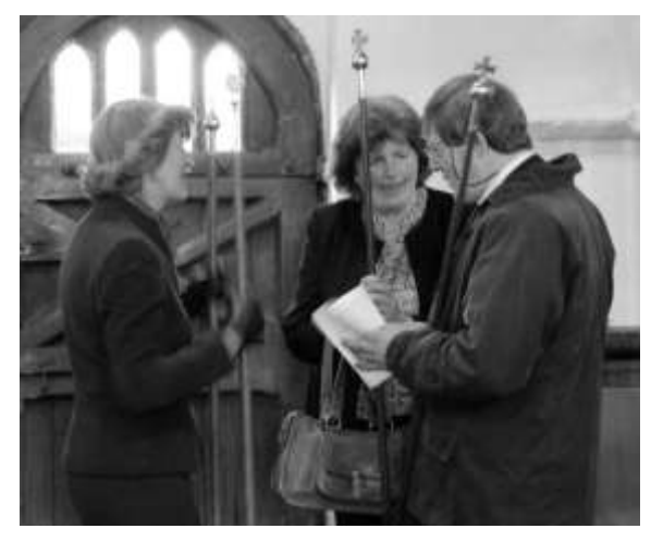
A huddle of churchwardens