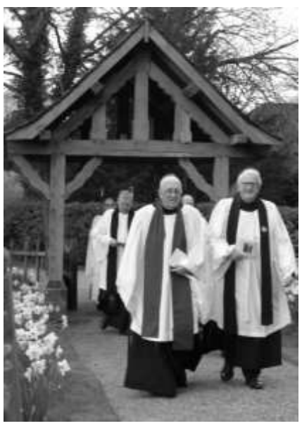
Clergy procession before the service